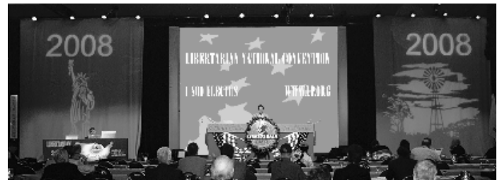
National Convention 2008

Even if you’re shy, we have projects you can do from home. If you’re a good communicator, we have letters to write and emails to answer.